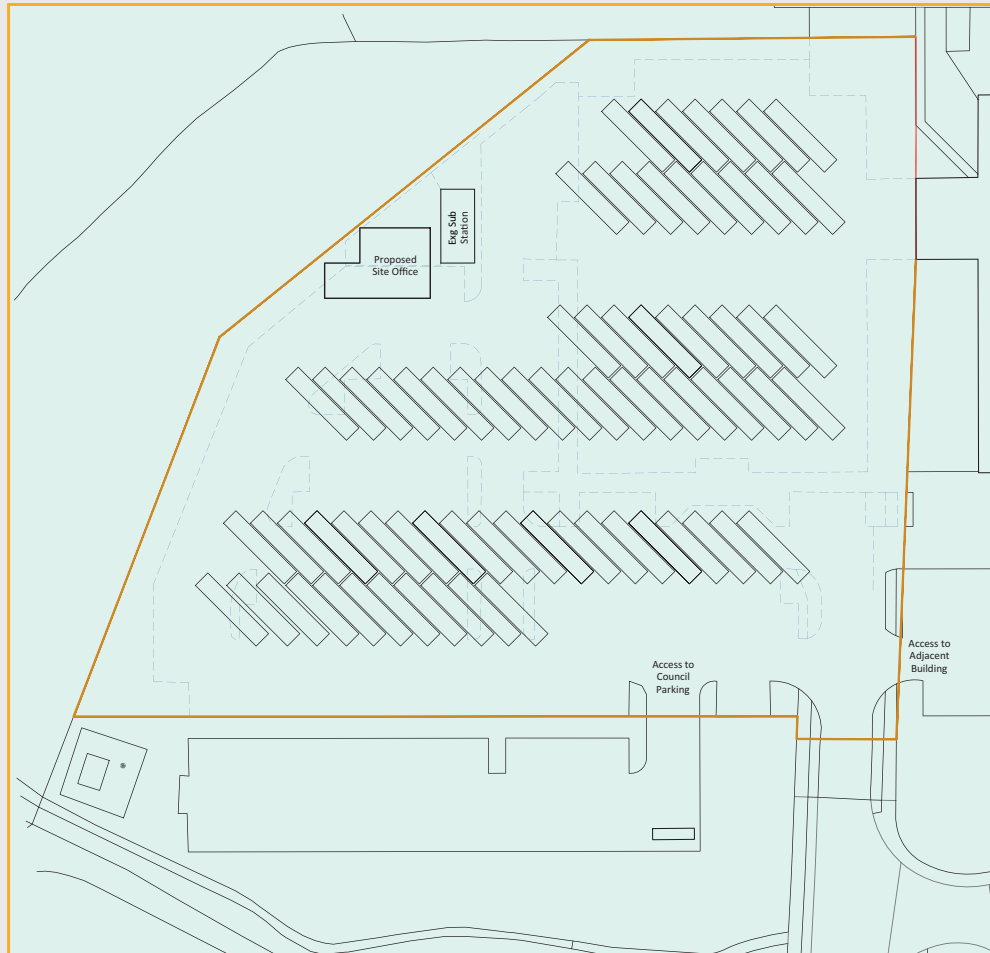
lorry park option 1 42 lorry spaces