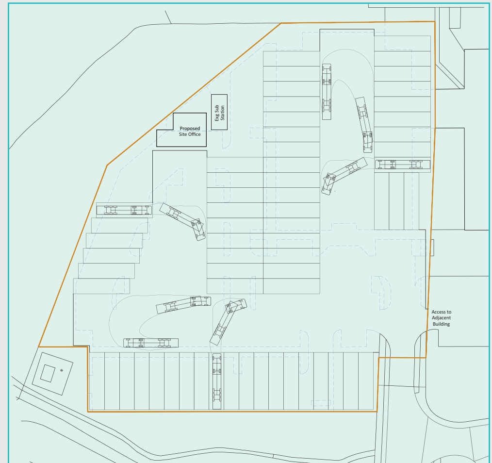
lorry park option 2 63 lorry spaces