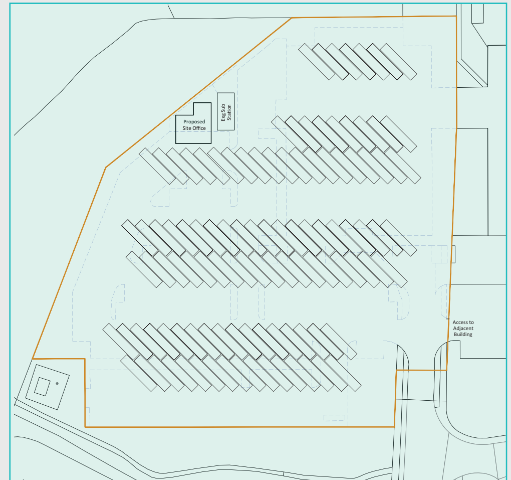
container store option 2 107 container stores